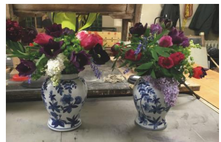
Flowers For Ham House

Ham House is going to be featured in the BBC's Antiques Road Show this year, which should be really interesting. We may spot some of our flower arranging friends in the audience. Let's hope they go inside for a few moments and we can see their flower arrangements in the background.